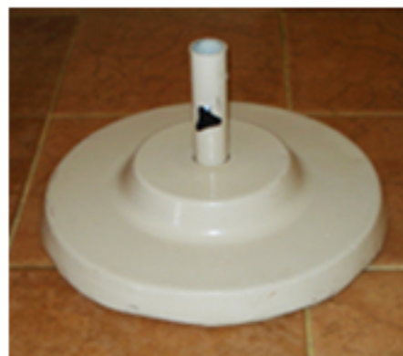
UB19 67 pounds 19" diameter umbrella stand Painted to match UB19-8 w/8" post (as shown) UB19-16 w/16" post (see insert)