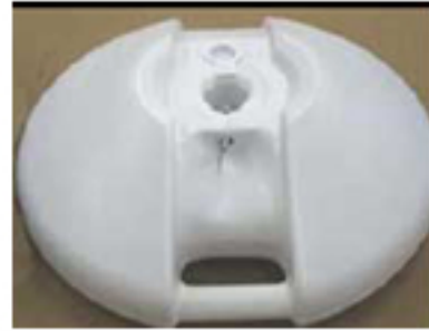
WP001 50lb / 18 inch diameter Plastic covered, Cement base Black or Forest Green