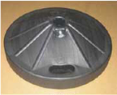
WP001 50lb / 18 inch diameter Plastic covered, Cement base Black or Forest Green