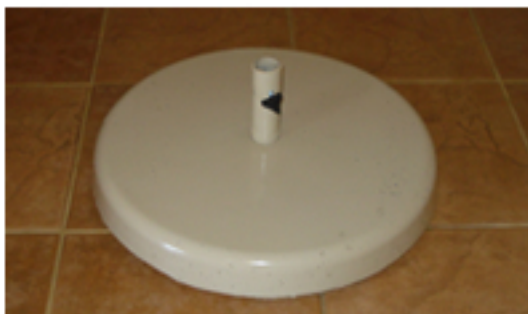
UB24 99 pounds 24" diameter umbrella stand Painted to match UB24-8 w/8" post (as shown) UB24-16 w/16" post (see insert)