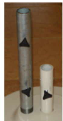
UB19-16 UB24-16 16" insert