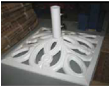
MX39 90lb / 23.5 inch diameter 1.5 inch neck only Cast Iron Base Black or White